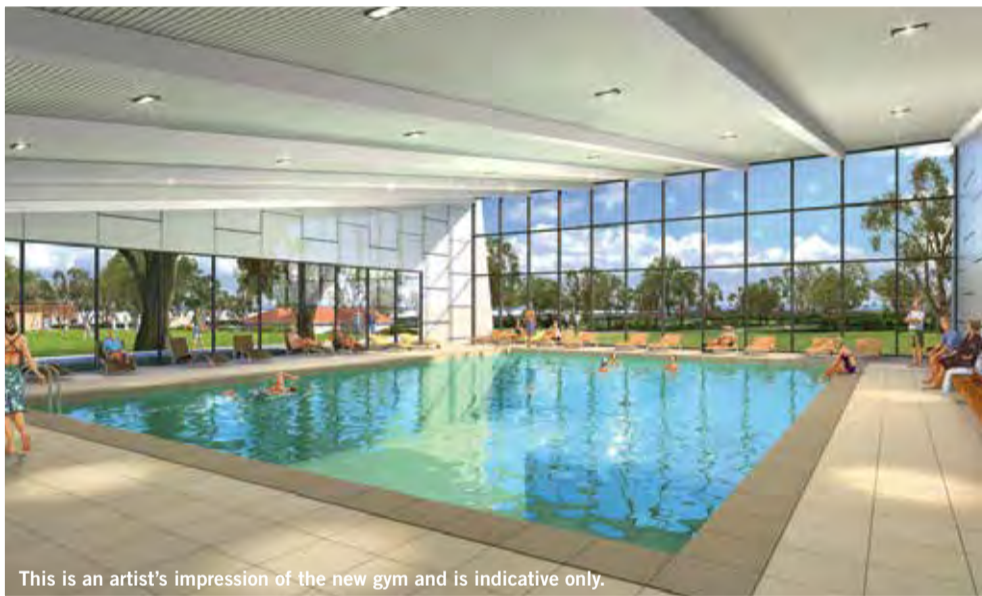
This is an artist's impression of the new pool and is indicative only.

Imagine waking up with a morning swim in the new 15m x 14m indoor lap pool overlooking a natural bush setting, relaxing with a yoga class in the studio space, sweating it out with an afternoon personal training session in the fully equipped gym - or simply chill out with a Sunday afternoon matinee in the 50 seater cinema. We invite you to discover the kind of lifestyle you could enjoy at Tuart Lakes Lifestyle Resort. To take a tour of this resort, call 1300 827 418 today.